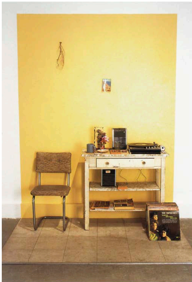
Left: Jack Pierson, Diamond Life , 1990, table, chair, record player, record albums, books, ashtray, coffee cup, miscellaneous items, linoleum flooring, painted wall, 96 × 60 × 40".