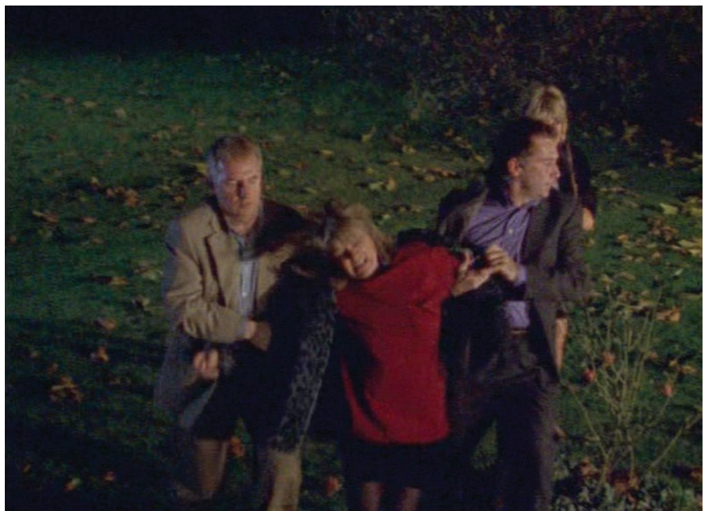
below: I Love You , 1999, colour video projection with sound, 60 min