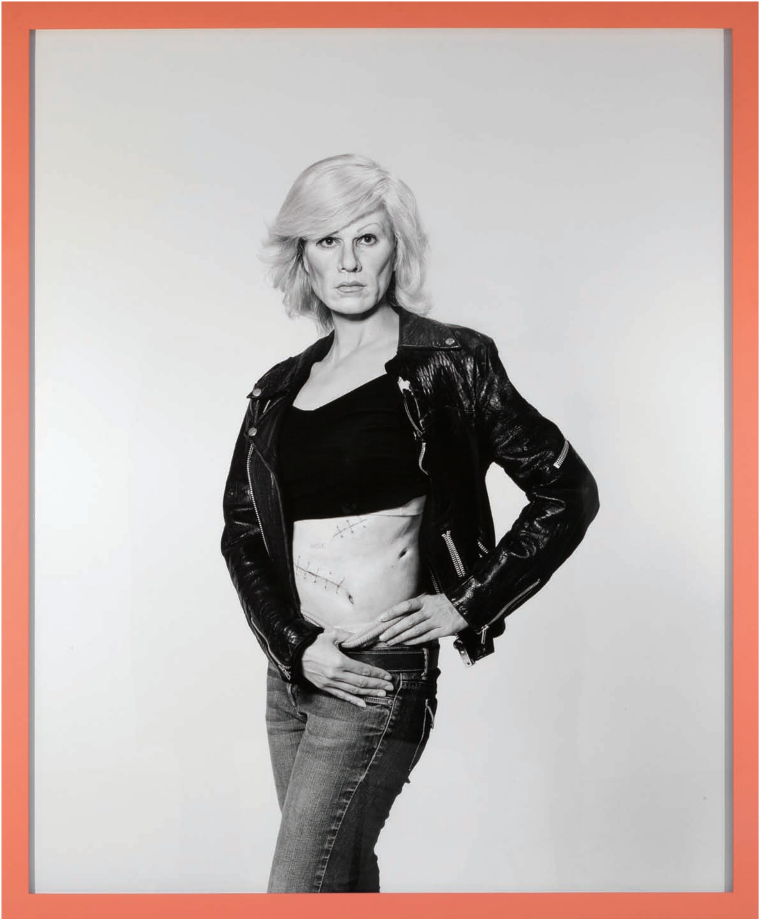
Me as Warhol in Drag with Scar , 2010, framed bromide print, 156 x 133 cm