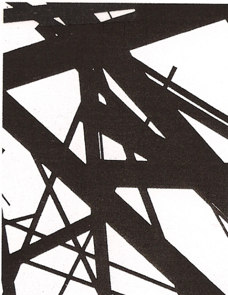
Upper right: James Welling, August 16A , 1980 , black-and-white photograph, 4 \frac{1}{2} x 3 \frac{3}{4} ". Above, left to right: James Welling, Moveable Bridge , New York, NY, 1990 , black-and-white photograph, 22 x 18". James Welling, #7, 1999 , black-and-white photograph, 35 \frac{1}{4} x 26 \frac{1}{2} ".