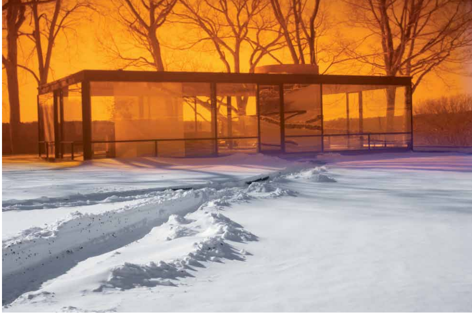
Above and left: James Welling, 0865, 2009, inkjet print, 83.8 × 126cm, and 0775, 2006, inkjet print, 83.8 × 126cm, both from the series Glass House

proved less baffling to certain viewers, she argues, if those velvet folds were to have provided a backdrop for the display of some luxury commodity, such as ‘a Cartier bracelet’ — and such thwarted expectations are precisely the point. 7 For Solomon-Godeau ‘the absence of the object’ (i.e. the ostensibly ‘missing’ luxury item, rather than the pastry dough actually pictured) is ‘synonymous with the absence of a subject’, and is primarily ‘a way of playing off what we expect the photograph to be setting up: a stable meaning, a “naturalised content”’. 8 Though understandable in light of the close bonds and shared concerns evident among the Pictures artists at the time, this insistence on the conspicuous absence of the luxury object now seems tantamount to advising the viewer faced with a photograph by Welling to think also (if not instead) of one by Kruger or Prince. Solomon-Godeau acknowledges Welling as the only one of the artists she discusses ‘who makes, rather than takes (literally)’, his photographs. Yet any links with the tradition of High Modernist art photography suggested