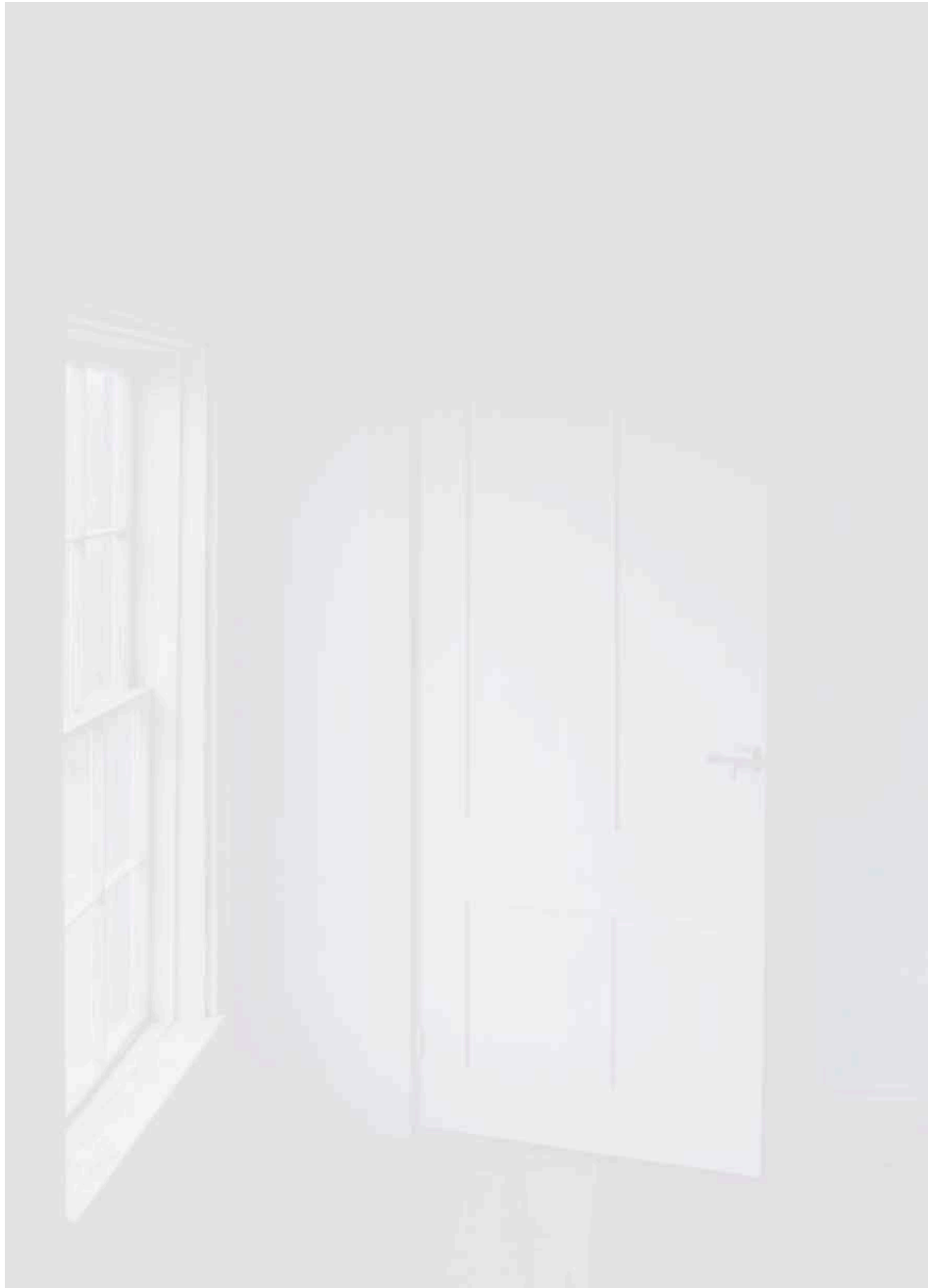
James Welling, Revenant , 2010, archival inkjet print on rag paper, 106.7 × 71.1cm