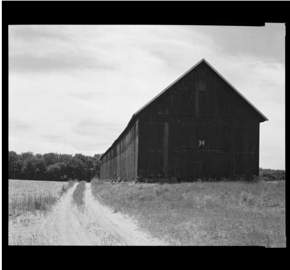
James Welling, Barn 34, South Glastonbury, CT , 2002, inkjet print, 63.5 × 73cm

of Wyeth's framing devices'. 16 He even goes so far as to remark on the 'uncanny resemblance' between the pastry-dough photographs and Wyeth's 'paintings of melting snow'. 17 This observation seems less surprising when we recall the evocative titles Welling gave to some of these early images, which include The Waterfall , Wreckage and Island (all 1981).