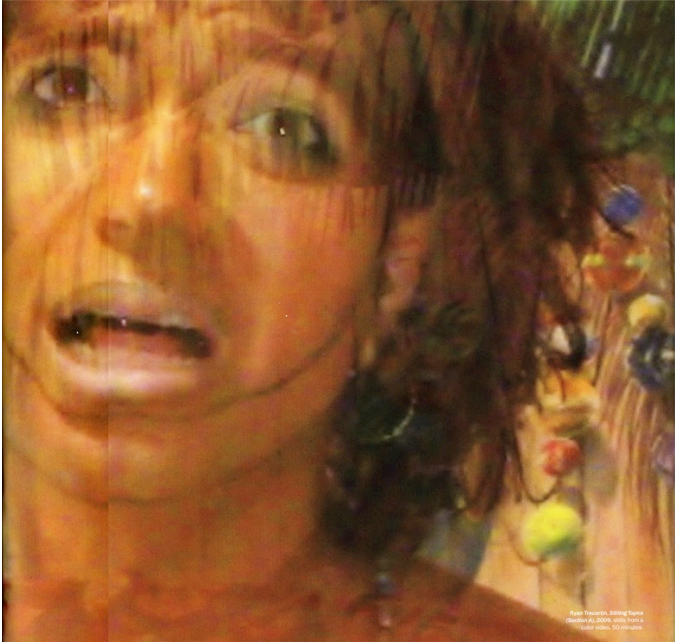
Ryan Trecartin, Sibling Topica (Section A), 2009, stills from a color video, 50 minutes.