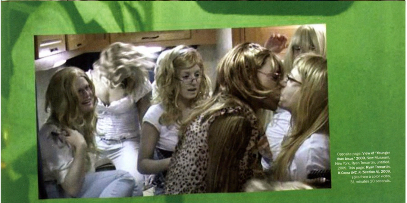
Opposite page: View of "Younger than Jesus," 2009, New Museum, New York. Ryan Trecartin, untitled, 2009. This page: Ryan Trecartin, K-Corea INC. K (Section A), 2009, stills from a color video, 31 minutes 20 seconds.