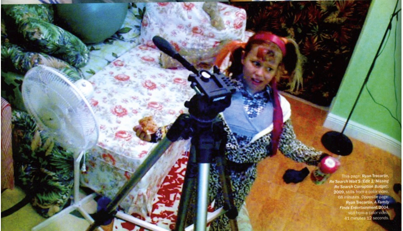
This page: Ryan Trecartin, Re'Search Wait 'S (Edit 1: Missing Re'Search Corruption Budget ), 2009, stills from a color video, 68 minutes. Opposite page: Ryan Trecartin, A Family Finds Entertainment , 2004, still from a color video, 41 minutes 12 seconds.