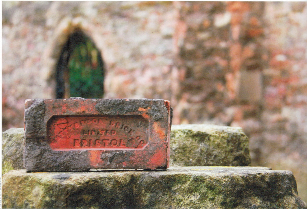
Cattybrook Brick Co. brick Opposite Temple Church, after the German bombing of 24 November 1940

‘By offering a microphone and a stage to the broadest spectrum of people possible, and giving them light, saying, “Hey, it’s your time to burn”, you realize that our cities are much more complicated than we give them credit for.’ As the Chicago-based artist, curator, urbanist and facilitator THEASTER GATES launched Sanctum in Bristol, he spoke to EMILY STEER about laying down the plans, stepping back and inviting the city to make it happen.