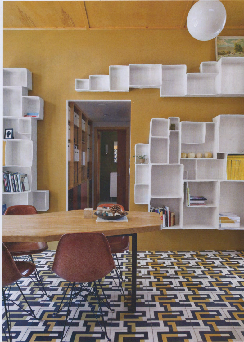
above Aggregated Stacks, A-Z West, 2010.