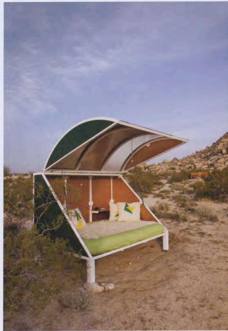
A-Z Wagon Station, 2003-15

Eye on Design: Andrea Zittel's Aggregated Stacks and the Collection of the Palm Springs Art Museum is on view at the Palm Springs Art Museum through 12 July; Andrea Zittel: The Flat Field Works can be seen at Middelheim Museum, Antwerp, from 13 June through 27 September