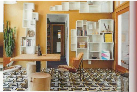
Above: A collection of A-Z Aggregated Stacks in Zittel's kitchen. The tiles are an artwork that Zittel fabricated in Mexico. Left: A view of Zittel's multipurpose large flat platform, which is influenced by Donald Judd's "Bench," currently in the living room of her cabin. "I love this idea that maybe it would be the only piece of furniture that you would have in your house," Zittel says.

the idea of a grid—how the grid is representative of this kind of idealism that we create, but the reality of human perfection is that the grid always shifts."