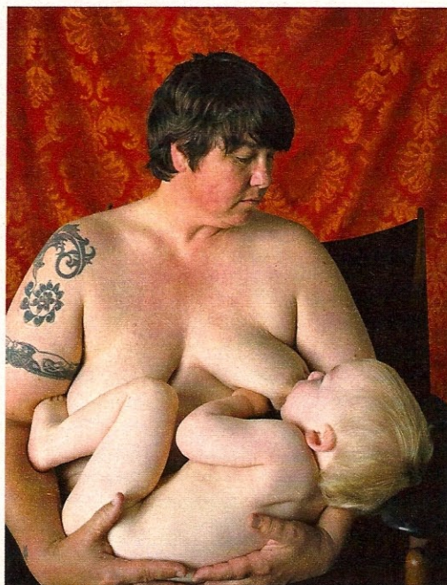
Visual feast Opie’s work, clockwise from left: “Self-Portrait/Nursing,” 2004; “Football Landscape #8 (Crenshaw vs. Jefferson, Los Angeles, CA),” 2007; “Untitled #14,” from the 1997 “Mini-Mall” series.

Opie’s experience with S-and-M goes back to the early 1980s, when she moved to San Francisco to attend the Art Institute and began dating a player in the fetish world. “I was going to art school, working the lobster shift in a residence hotel and submitting photographs to On Our