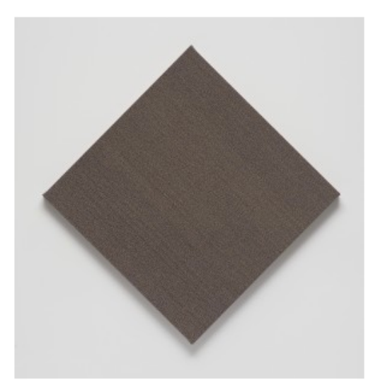
4 Willem de Rooij, Schwarz, Quadrat, 2015.

3 Willem de Rooij, Gelb, Parallelogramm, 2015.