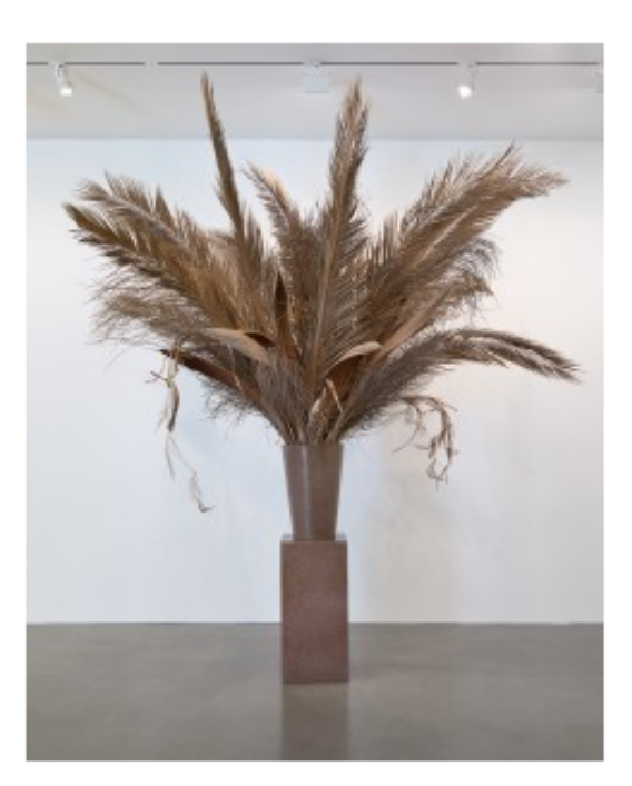
9 Willem de Rooij, Bouquet XVI, 2015.