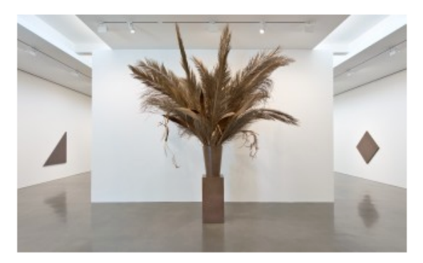
6 View of Willem de Rooij's "Legal Noses," Regen Projects, Los Angeles, 2015.