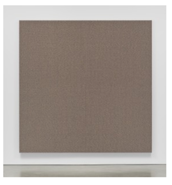
7 Willem de Rooij, Gemischt, gross, 2015.