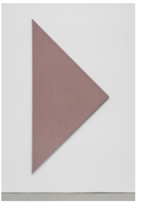
8 Willem de Rooij, Rosa, Dreieck, 2015.