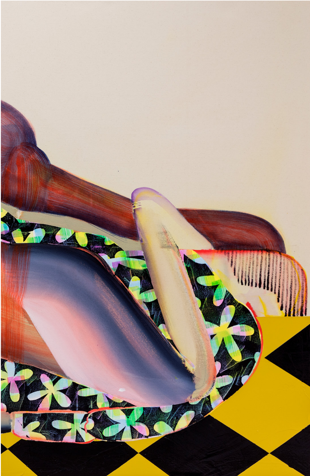
CHRISTINA QUARLES. "GROUNDED BY THE SIDE OF YEW" (2017). ACRYLIC ON CANVAS, 55 X 86 IN. COURTESY OF THE ARTIST, PILAR CORRIAS GALLERY, LONDON, AND DAVID CASTILLO GALLERY, MIAMI.