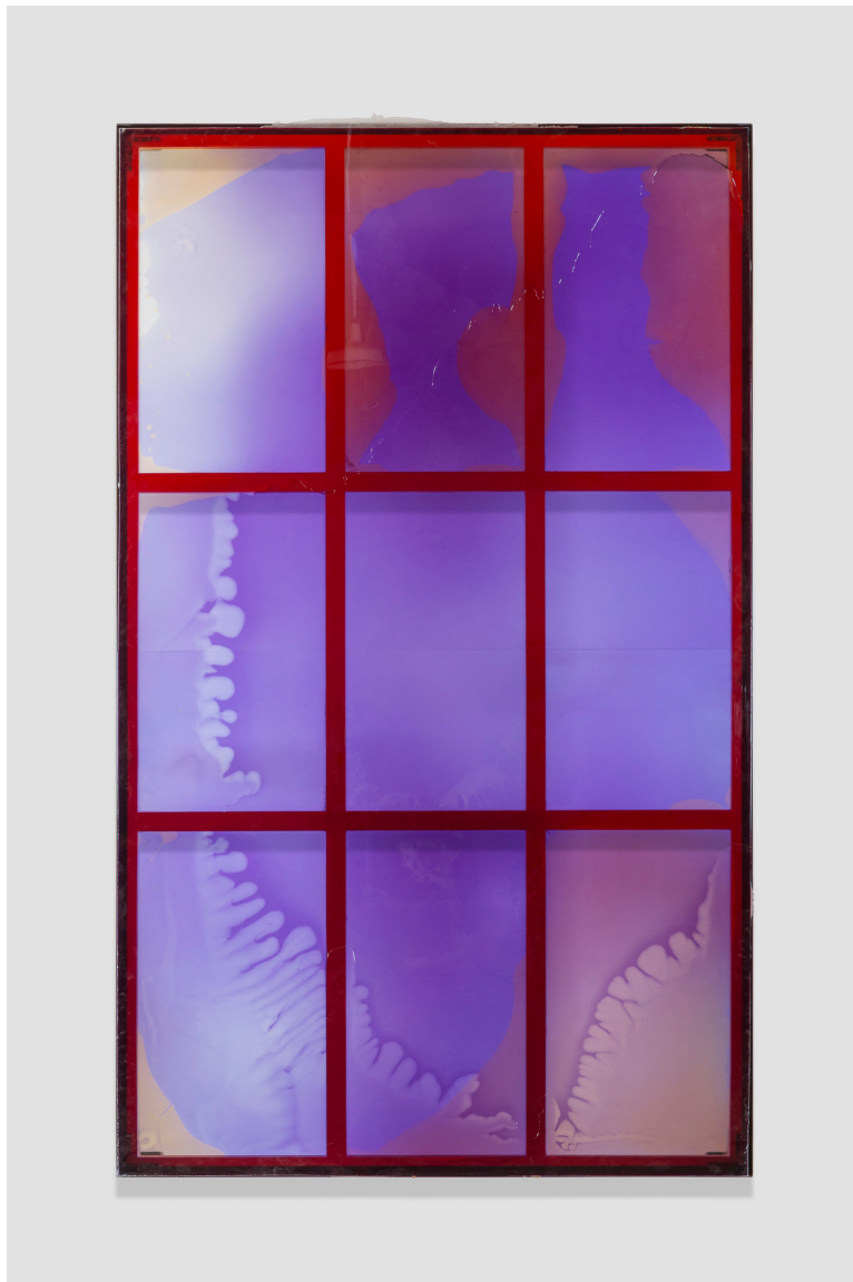
"[To be titled]," 2015.

The space hasn't affected the scale of his works much — "I tried not to carry away with it," he says — but it did provide the added ventilation necessary to continue his experimentation with noxious chemicals, his means of translating his painterly vocabulary into different media. Early on, Hubbard applied fiberglass and resin directly to canvas, later introducing the "bent painting," the three-dimensional form of a painting cast in urethane and molded into sometimes freestanding sculptures, at Zurich's Galerie Eva Presenhuber in 2013.