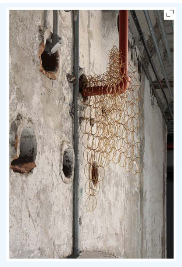
Liz Larner, Guest , 2004. Gold-plated bronze, square section, dimensions variable. Photo: Cathy Carver. © Liz Larner.

around a rust-colored conduit emerging from a hole—proving Larner's enthusiasm for the unique features of the raw space and her commitment to her exhibition title's imperative.