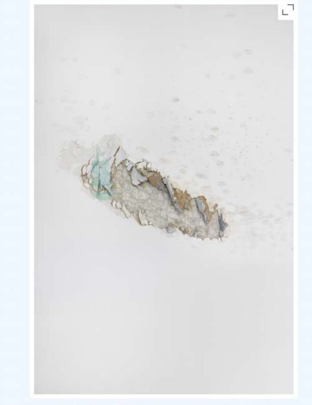
Liz Larner: Don't put it back like it was, installation view. Pictured: Liz Larner, Corner Basher, 1988 (detail). Steel, stainless steel, electric motor, speed control, 106 × 36 × 36 inches. Courtesy Gaby and Wilhelm Schürmann Collection. Photo: Cathy Carver. © Liz Larner.

use them and thus to begin the experience of the exhibition with their senses awakened, not just by the dangerous sculpture's auditory and vibratory effects and its towering silhouette, but by the thrill of destruction.