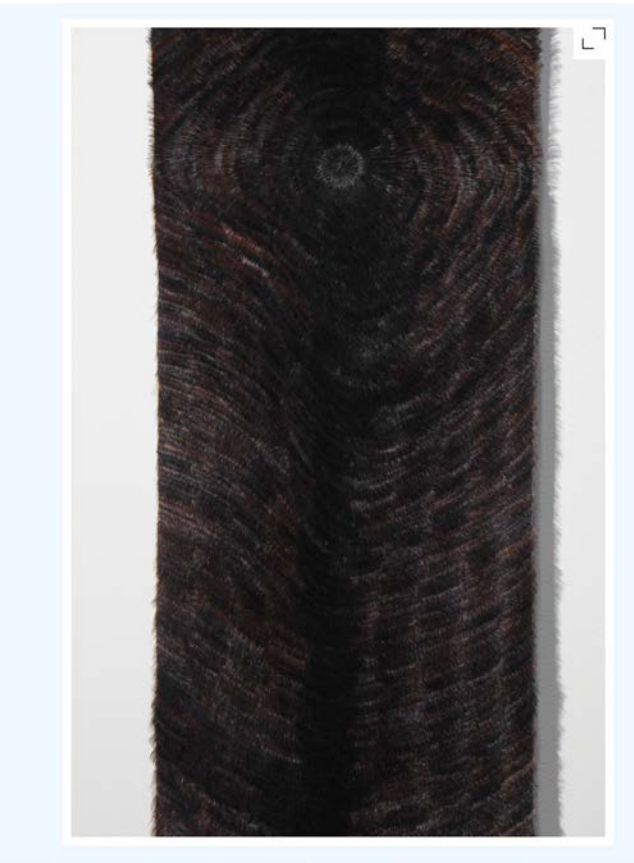
Liz Larner, Lash Mat, 1989 (detail). Leather, false eyelashes made from human hair, glue, 122 1/2 \times 11 1/2 \times 3/8 inches. Photo: Cathy Carver. © Liz Larner.

The elegantly unsettling Lash Mat (1989) is a wall-based work in which a long column of leather spills onto the floor to curl like a furry tongue, countless dense lines of glued-on false eyelashes rendering it surreally obscene, the bold geometry of its form and the grotesque excess of its top layer at odds with the demure associations of the fragile cosmetic accessories that flock it. Wrapped Corner (1991) is a rather butch use of hardware, a severe configuration of chain, whose cold stripes make a ninety degree turn around the edge of a wall in a gesture of containment and creeping movement; in contrast, Too the Wall (1990) uses steel to span a corner-or to block it off with a kind of delicate passive aggression-employing an expanding succession of spidery, necklacelike lines. No M, No D, Only S & B (1990), whose cryptic title refers to a parentless family (with only sisters and brothers), is a rhizomatic, scrotal cluster of leather bulbs, which threatens to grow in all directions, it seems, recalling boxing gloves with its bloated, sewn construction. And Bird in Space (1989) is a feat of taut nylon rope, a shimmering, airy, impermanent interpretation of Brâncusi's lithe, vertical creature, which (unlike his solid, one might say phallic, version) spreads its wings in an extravagant, variable use of space. (The cords must be extended or anchored differently according to the dimensions of its venue.)