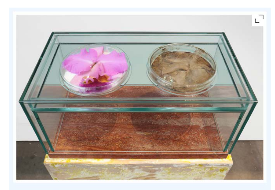
Liz Larner: Don't put it back like it was, installation view. Pictured: Liz Larner, Orchid, Buttermilk, Penny, 1987. Orchid, buttermilk, penny, glass, 43 7/16 \times 17 1/2 \times 10 1/8 inches.

Wordplay in titles, and a companion poetic approach to materials, is one thread connecting dissimilar sculptures. Among the earliest objects on view are the petri-dish compositions of Cultures (1987-), which wryly combine artifacts of human civilization with microorganisms in an agar growth medium to literally and/or metaphorically feed off one another. Orchid, Buttermilk, Penny (1987) shows the title's elements, including its once-bright flower, as capsules of brown decay, in a vitrine mounted on a distressed plywood plinth. In Primary, Secondary: Culture of Empire State Building and Twin Towers (1988), petri dishes are again featured, this time divided into quadrants, filled with dark-hued samples and displayed on two levels of a curious glass and aluminum structure—a miniature, abstract skyscraper. And though Out of Touch (1987), a spherical floor sculpture resembling a small, mummified boulder or giant ball of twine. seems on its face to be nothing like this delicate bacteria-and-architecture-based sculpture, the checklist offers that it is made from sixteen miles of surgical gauze. Larner seems to be playing with notions of monumentality—by scaling down American symbols of technological and economic power, representing these obelisks as biomes in one instance, and by compressing an enormous, almost incomprehensible length of material into a comic lump in another.