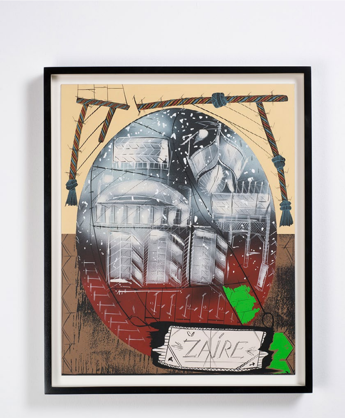
Snow globes with dead architecture