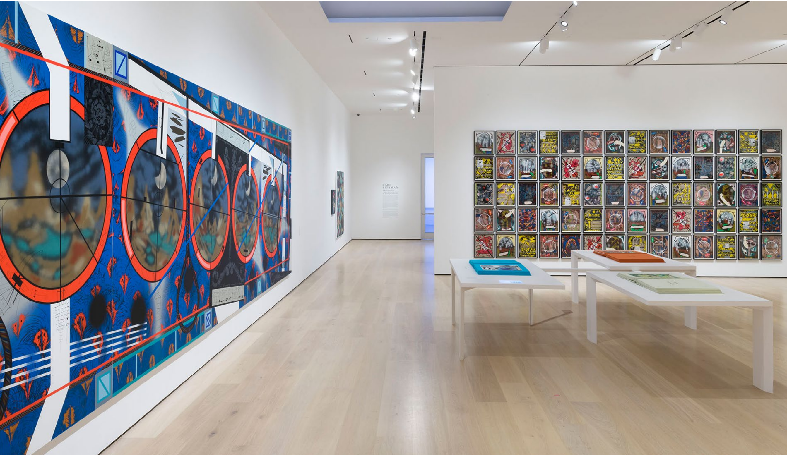
Installation view from Lari Pittman: Declaration of Independence Hammer Museum, Los Angeles September 29, 2019–January 5, 2020