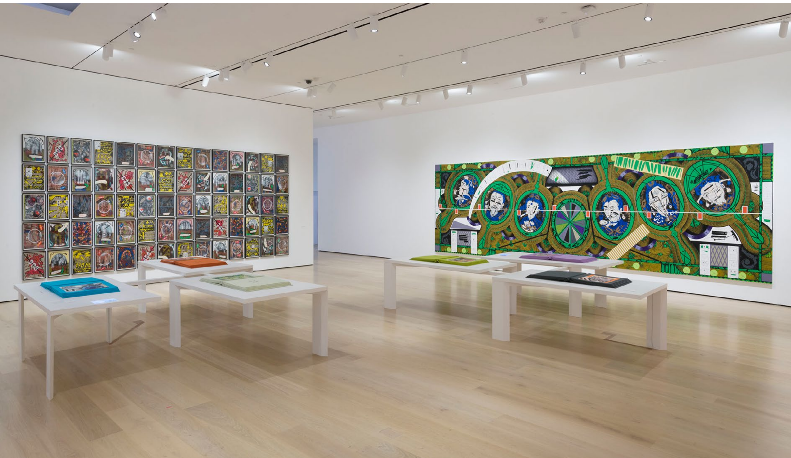
Installation view from Lari Pittman: Declaration of Independence Hammer Museum, Los Angeles September 29, 2019–January 5, 2020