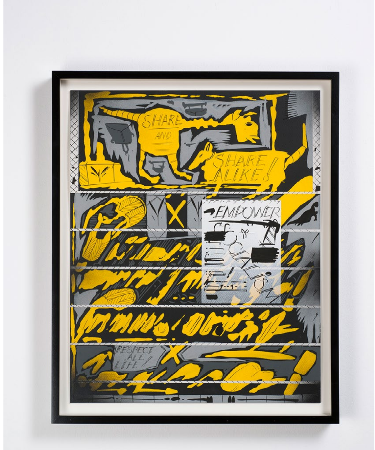
Manifestos that have failed