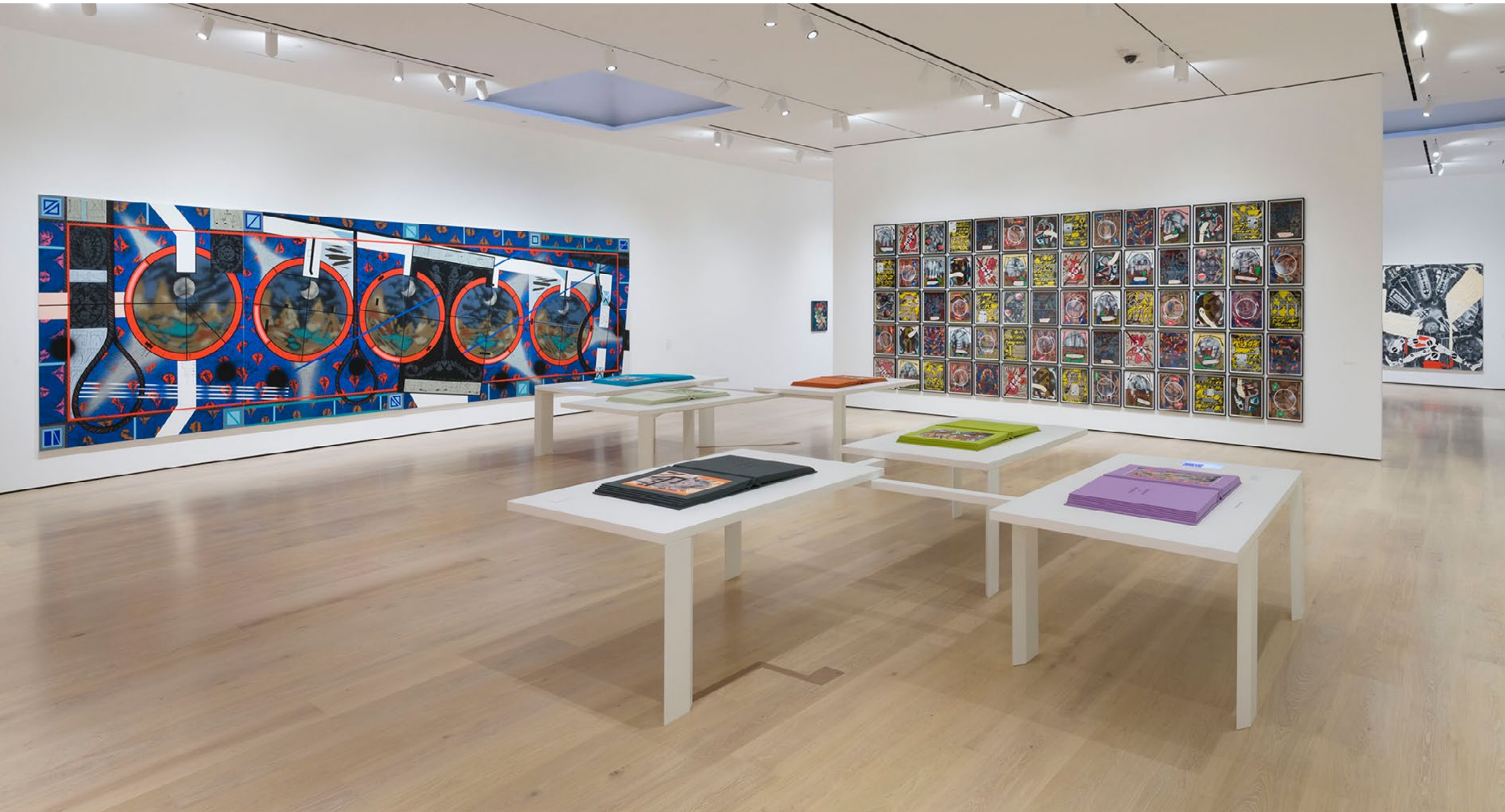
Installation view from Lari Pittman: Declaration of Independence Hammer Museum, Los Angeles September 29, 2019–January 5, 2020