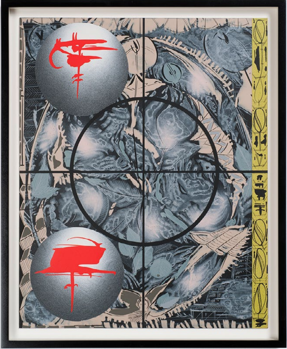
Genetically engineered food