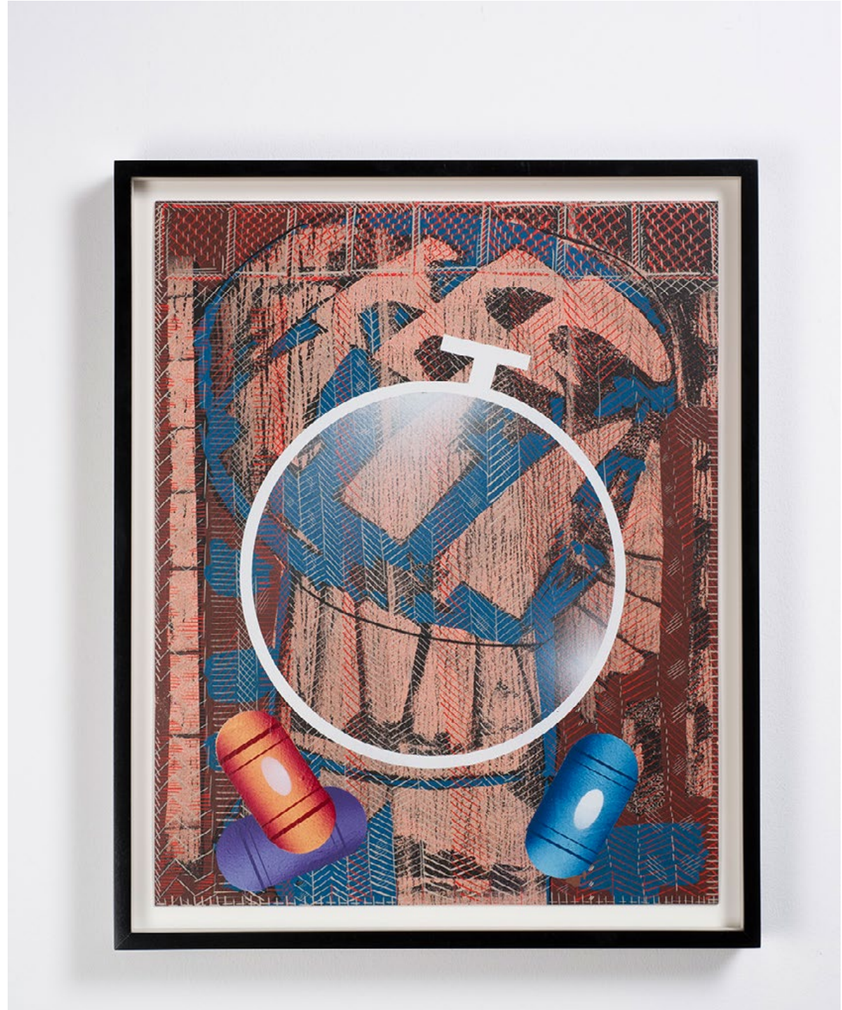
Needlepoints with antidepressant pills