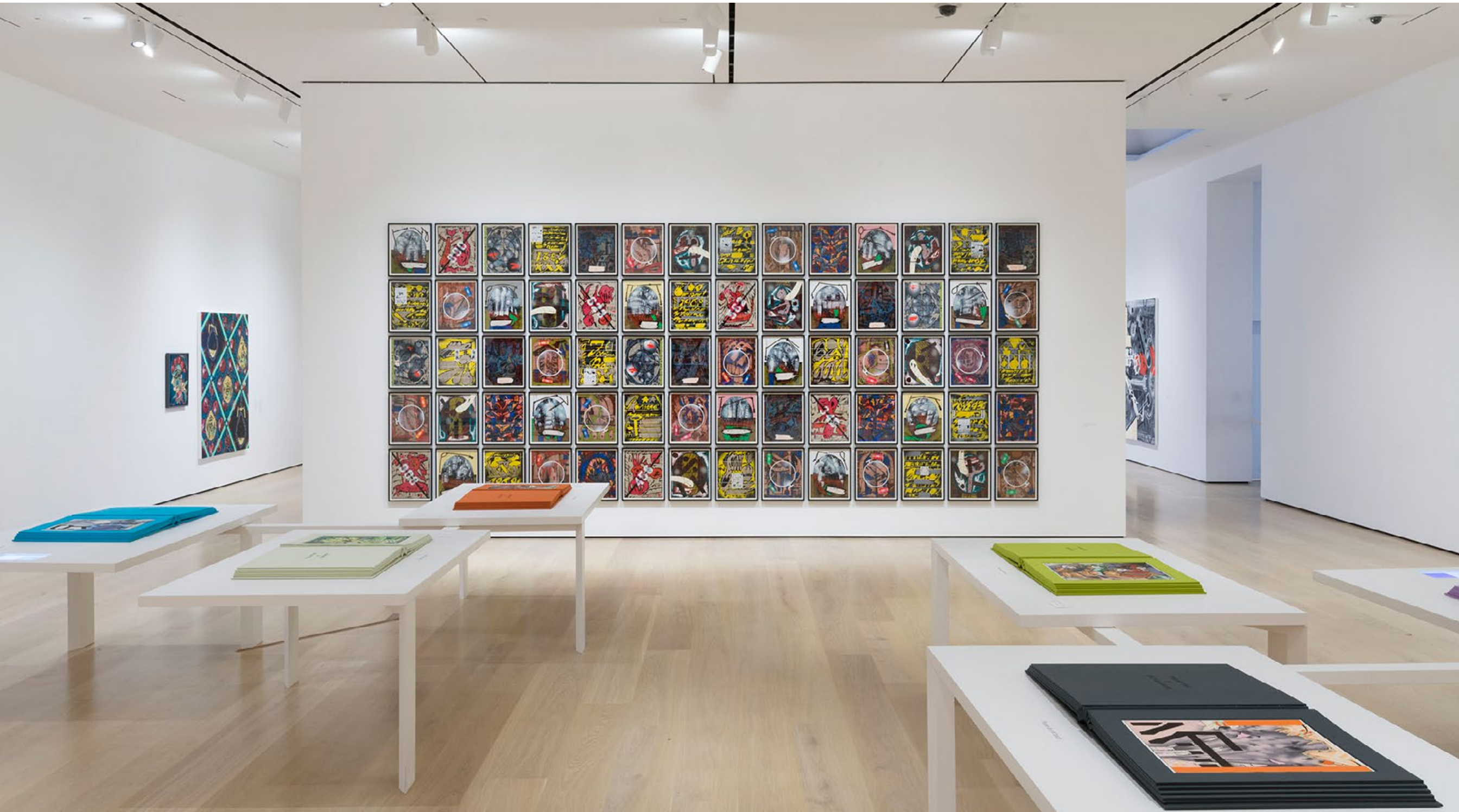
Installation view from Lari Pittman: Declaration of Independence Hammer Museum, Los Angeles September 29, 2019–January 5, 2020