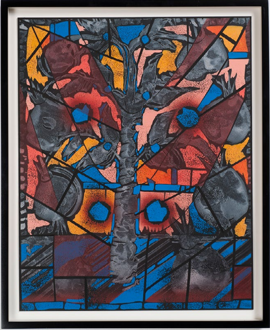
Stained glass windows for underground bunkers