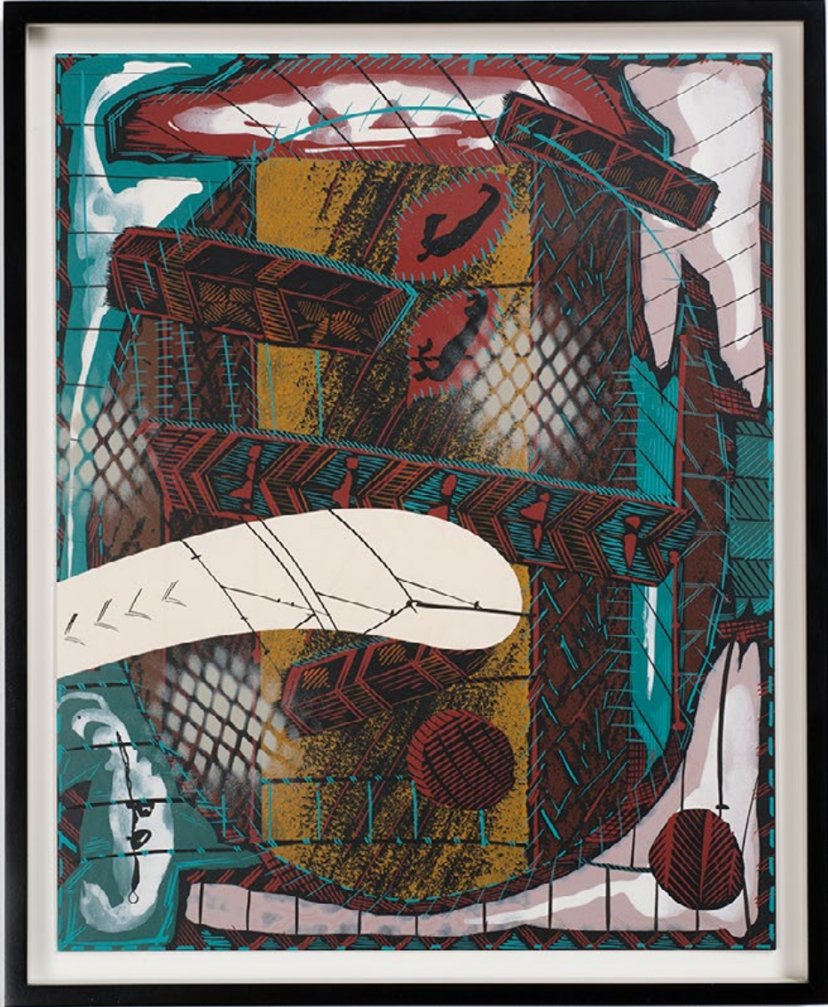
Aerial night views of secured districts