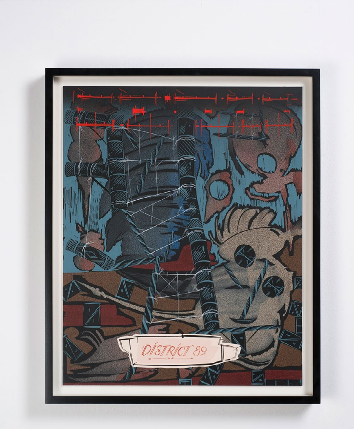
Aerial night views of secured districts