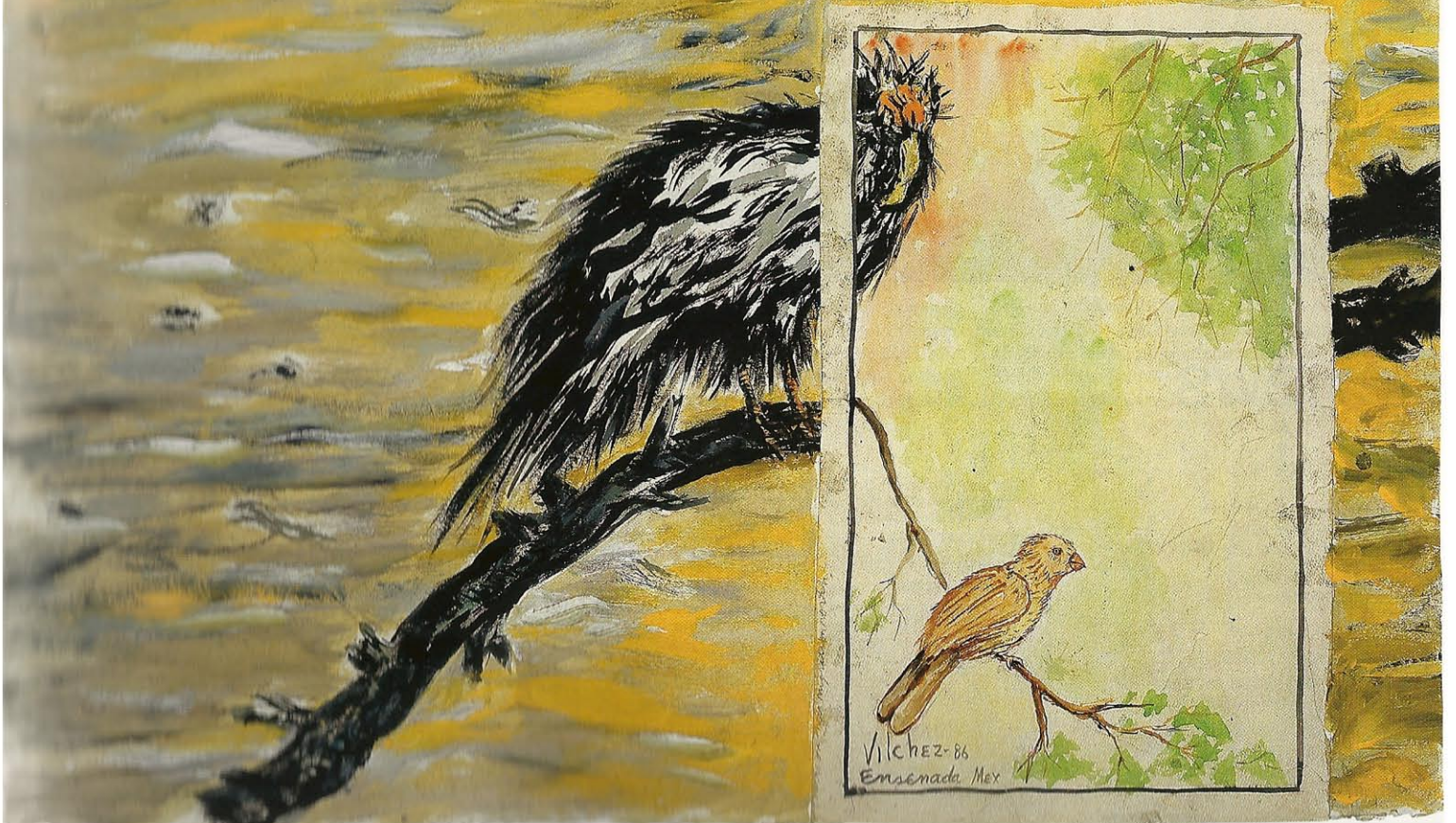
Raymond Pettibon, No Title (Since they were) , 2008, pen, ink, gouache, acrylic, and collage on paper, 22 x 27 1/2".

SINCE THEY WERE MADE OUR STATE BIRD AND A PROTECTED SPECIES THE CALIFORNIA CONDOR HAS INCREASED IN NUMBERS AND PRIVILEGES.