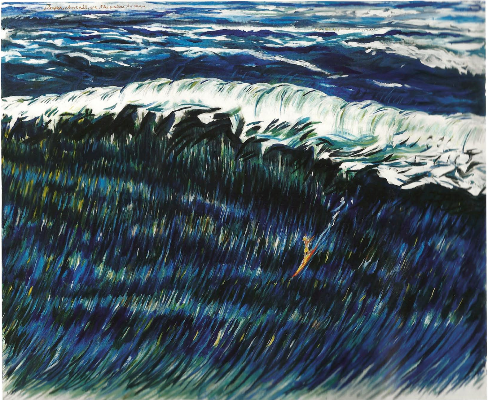
Raymond Pettibon, No Title (Deeper above all . . .) , 2011, pen, ink, and gouache on paper, 69½ x 84½".