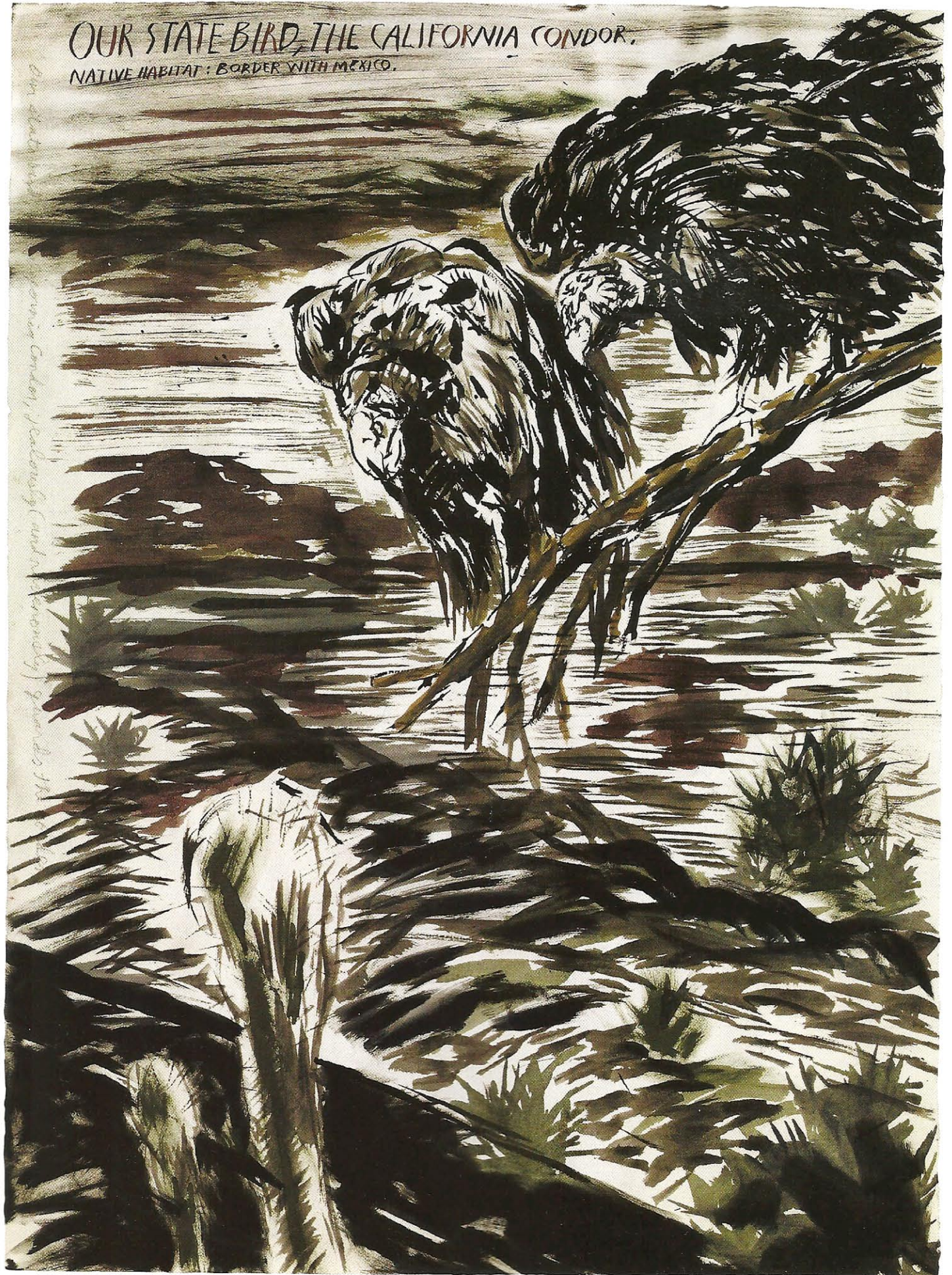
Raymond Pettibon, No Title (Our State Bird), 2007, pen, ink, and gouache on paper, 30 x 22 1/4".

OUR STATE BIRD, THE CALIFORNIA CONDOR. NATIVE HABITAT: BORDER WITH MEXICO.