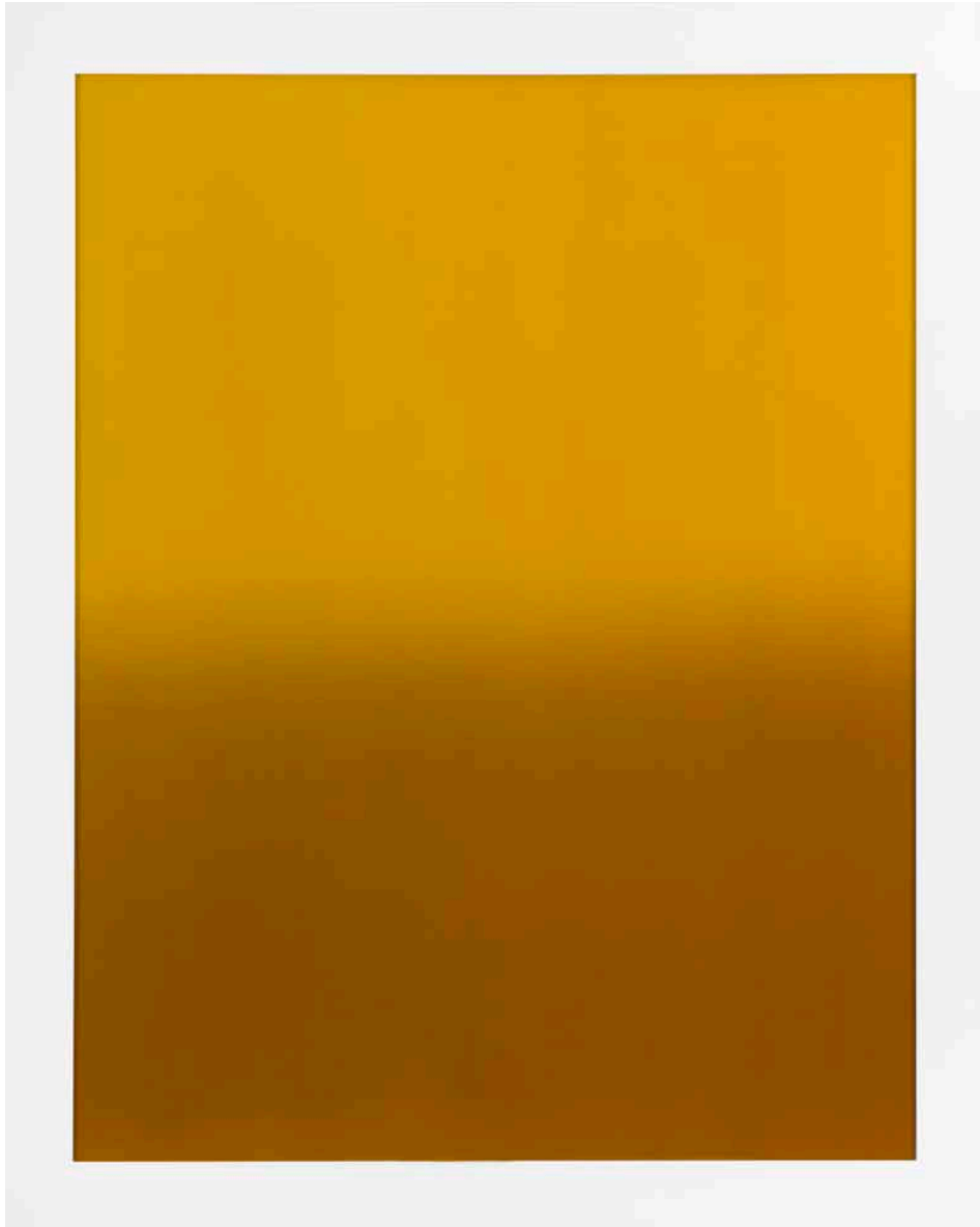
James Welling, ISLB , 2004, unique c-type print mounted on plexi, 109.5 × 87.6 × 3.2cm, from the series Degradés