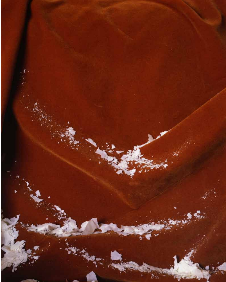
James Welling, Summation , 1981, inkjet print, 25.4 × 20.3cm.