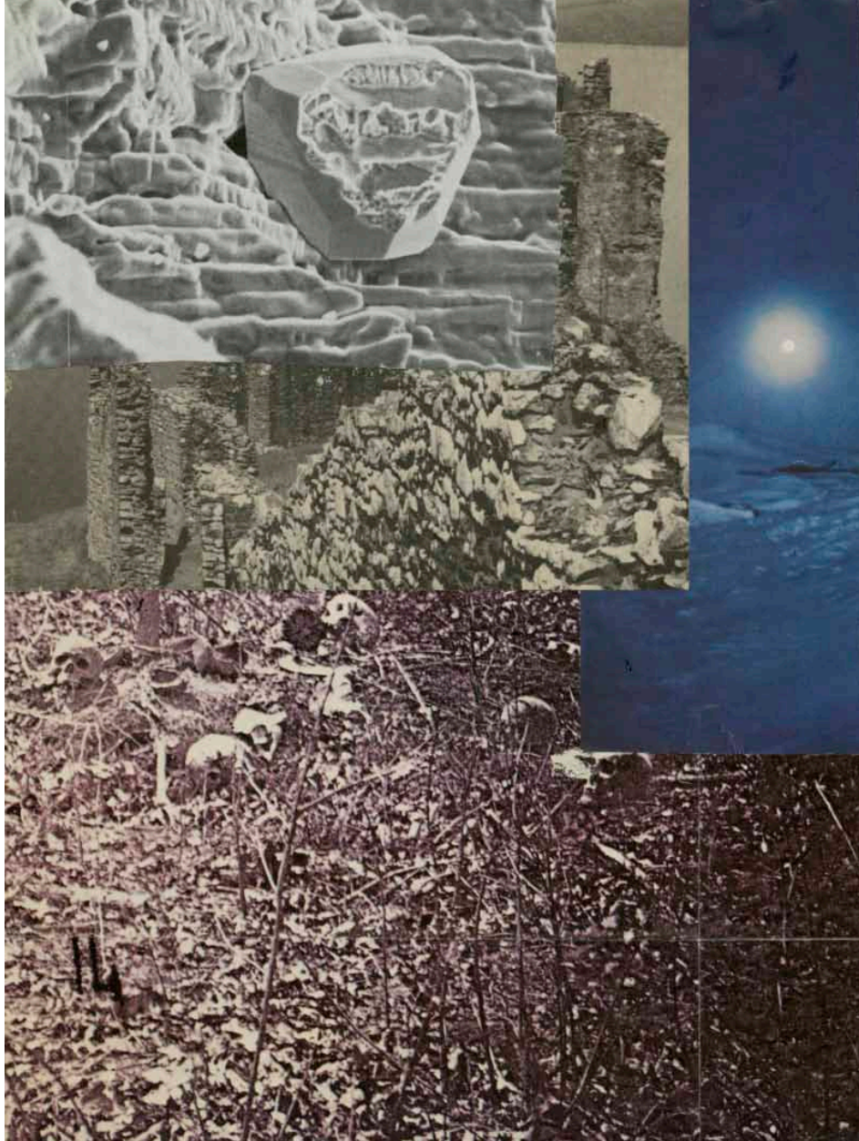
James Welling, Untitled , 1974—1976, offset lithography and tape on board, 33.7 × 17.1 cm.