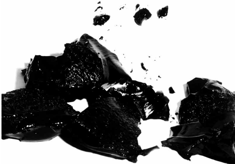
James Welling, Gelatin Photograph 45, 1984, inkjet print, 50.8 × 40.6cm.

camera on a tripod and make exposures of one second or longer. I began to control the colour in the Polaroids by heating or refrigerating the film as it developed. After six months I outgrew this camera and made an experimental camera out of a shoebox and a Polaroid back. And a few months later I purchased a four-by-five-inch view camera and taught myself how to process and print black-and-white sheet film.