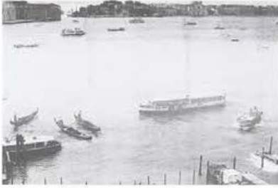
Venice 2007, C-Type print 181x252 cm