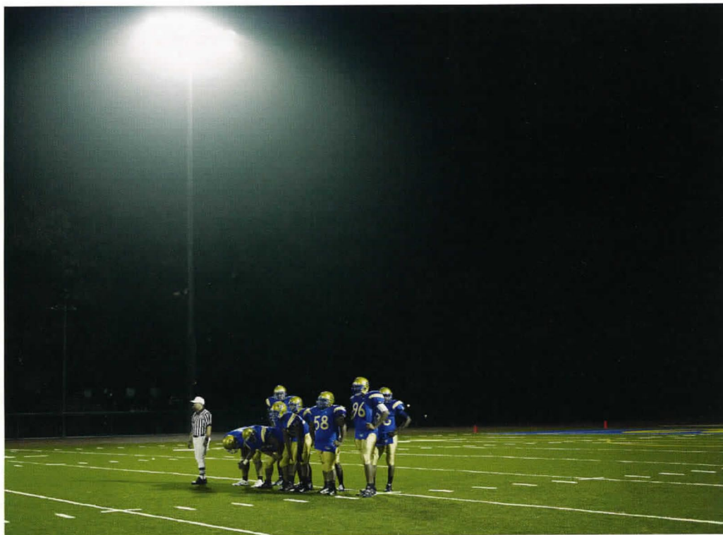
Football Landscape #9 (Crenshaw vs. Jefferson, Los Angeles, CA), 2007.