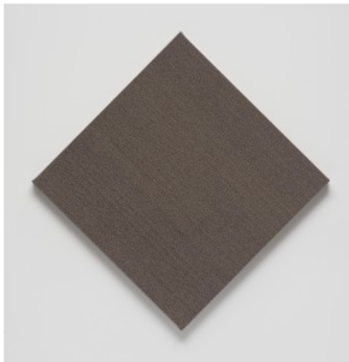
4 Willem de Rooij, Schwarz, Quadrat , 2015.