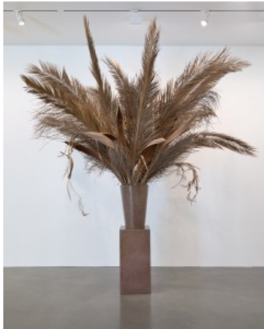
9 Willem de Rooij, Bouquet XVI , 2015.