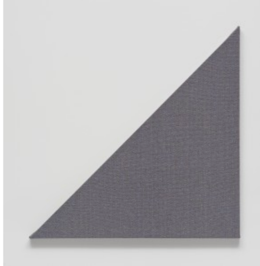
10 Willem de Rooij, Blau, Dreieck , 2015.