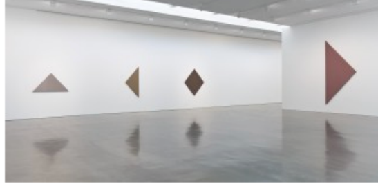
5 View of Willem de Rooij's "Legal Noses," Regen Projects, Los Angeles, 2015.