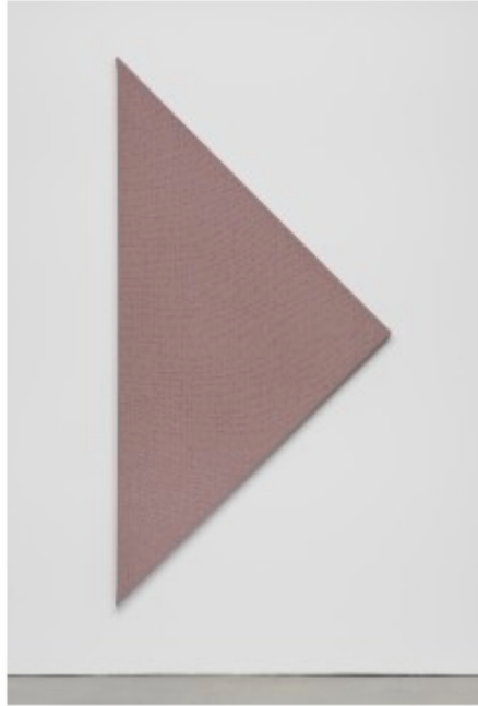
8 Willem de Rooij, Rosa, Dreieck , 2015.