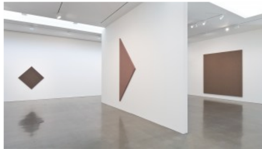
2 View of Willem de Rooij's "Legal Noses," Regen Projects, Los Angeles, 2015.