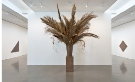
6 View of Willem de Rooij's "Legal Noses," Regen Projects, Los Angeles, 2015.