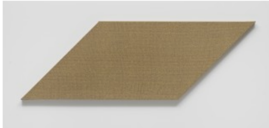
3 Willem de Rooij, Gelb, Parallelogramm , 2015.