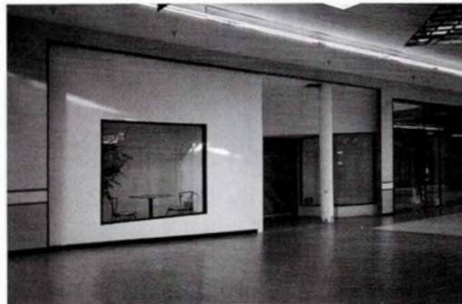
Walead Beshty, Dead Mall (details), 2002–2004. 20 black-and-white photographs, each 8 1/2 x 11 1/4". Top: Bridgeport, CT. Bottom: Poughkeepsie, NY.