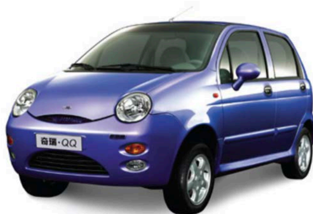
2006 CHERY QQ6