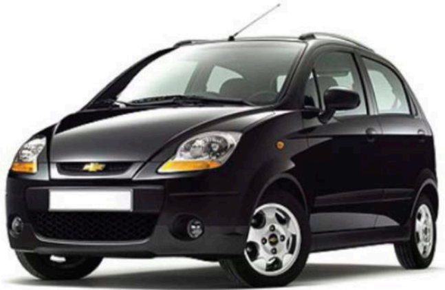
2006 CHEVY SPARK