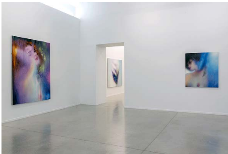
'All Wet: Marilyn Minter', 2021, exhibition view, Montpellier Contemporain, France

MM: Feminists of my age were horrified by women owning their sexuality. I was ahead of my time. I thought that everyone shared my opinion because I was in a group of pro-sex feminists. I was attending National Organization for Women meetings and defending abortion clinics, so to be called a traitor to feminism was a real shock. [Laughs.] It was a time of political correctness, and this level of feminism coming out of the 1970s was really anti-men and anti-sex. Taking porn and owning it for your own amusement and pleasure, as I did, was seen as a slap in the face. I got where the fear came from, but there was a group of feminists who were trying to ban sexual imagery, and I was the antithesis of that.