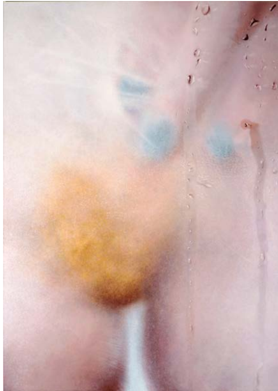
Marilyn Minter, Ginger , 2016, enamel on metal, 213 x 152 cm