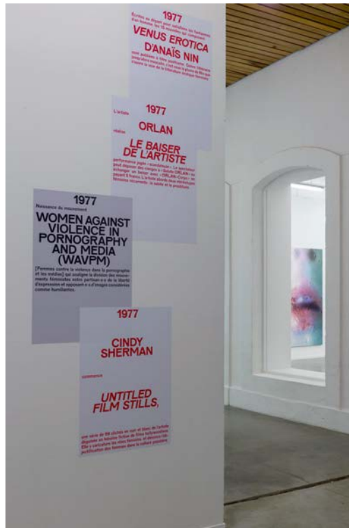
Timeline from 1969 to 2021 on the relationship between art, feminism, pornography and censorship